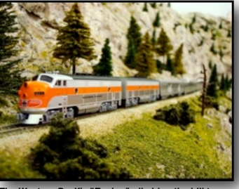
it on the N la

Day on June 26. Upcoming theme days will be Steam Day on July 24, UP/WP Day on August 28, Passenger Day on September 25, Southern Pacific Day on October 23, and concluding with MoW/Wreck Day on November 27. At our theme days you can expect to fine many trains representing that day's theme. It's a good chance to see your favorite trains in operation. --ed.