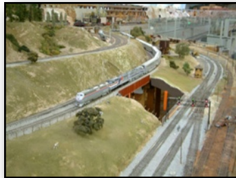
"Amtrak" east bound from Midway on the O Scale layout during Passenger theme day.

During the 2011 season we continued with our special theme trains every 4th Sunday of the month. Some of these included Unit Train Day on April 22, Amtrak Day on May 27. Upcoming theme days will be ATSF/BNSF Day on June 2, Steam /Transition Era Day on July 22, UP/ WP Day on August 26, Passenger Day on September 23, Southern Pacific Day on October 28, and concluding with "Foreign To California" Day on November 25. At our theme days you can expect to find many trains representing that day's theme. It's a good chance to see your favorite trains in operation. --ed.