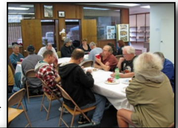
March Potluck and BBQ —photo by Walt Freedman.

As usual, the GSMRM members took a break from winter layout work on March 17th to do the yearly spring cleanup of the outdoor parking and landscape areas. This year we concentrated on cleaning the back storage areas and layouts. Under coordination of