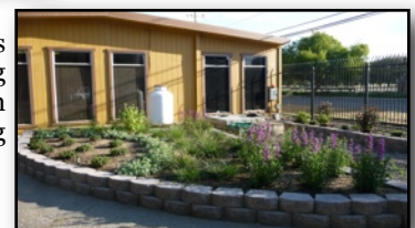
Front landscape work completed, March, 2012.

spring. Future work includes the areas behind the parking lot, the BBQ area across from the kitchen, the front parking lot area.-- ed.