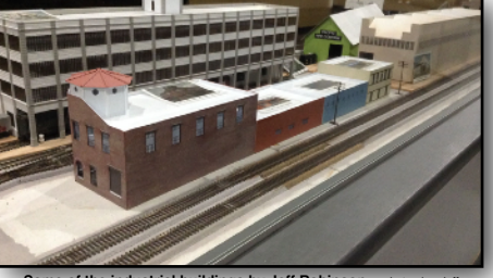
Some of the industrial buildings by Jeff Robinson.

in 2015 and 2016. Now all of the track is in operation – mainlines, sidings, and all of the industrial tracks. The main Wood Street section has over 50 feet of industrial track in its 20 foot length.